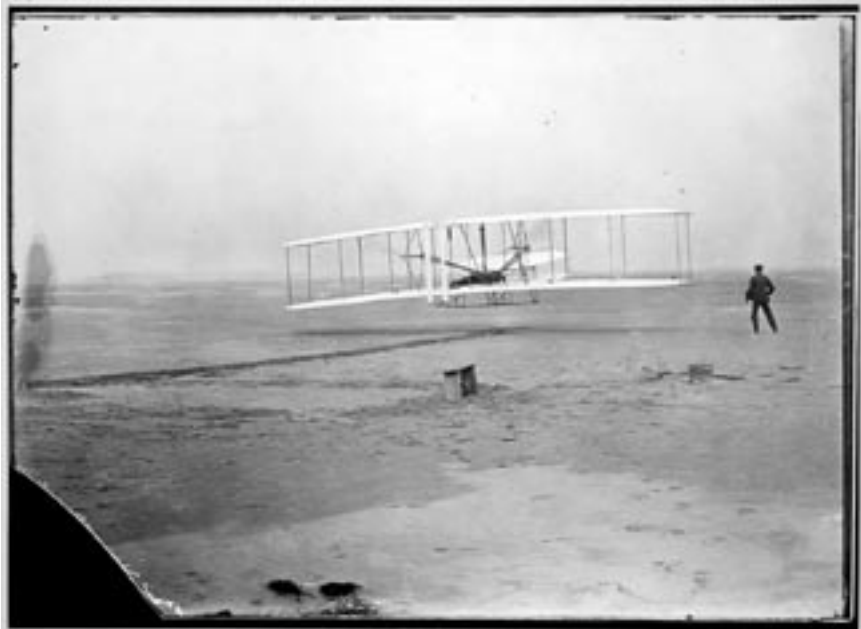
National Air and Space Museum, Smithsonian Institution