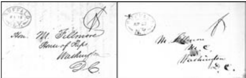
S. G. Haven's letter, left, and N. K. Hall's letter, right

Folded letter sheets sent by S. G. Haven, of Buffalo, in 1840, and one by N. K. Hall, also of Buffalo, in 1841, to their law partner and Congressman are right to the point. The recipient of those letters was a native of Cayuga County, born to pioneers in a log cabin.